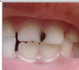
before and after SDF Application on front teeth (Rosenblatt et al J Dent Res 88(2): 116-125, 2009)